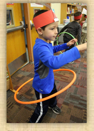
Read Across America Day