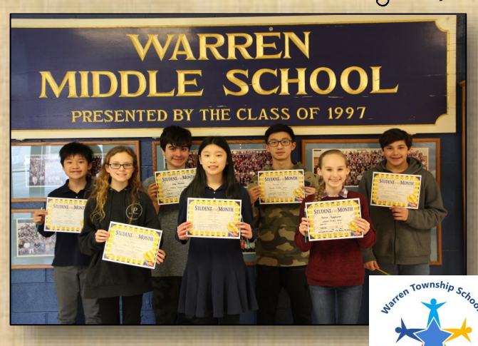
Page 6 of 7