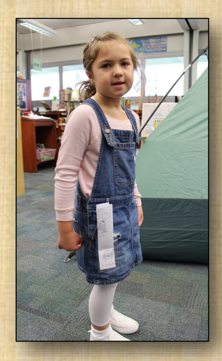
Poem in your Pocket Day