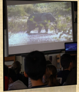
Virtual field trips to the Great Barrier Reef in Australia and to the African savanna.