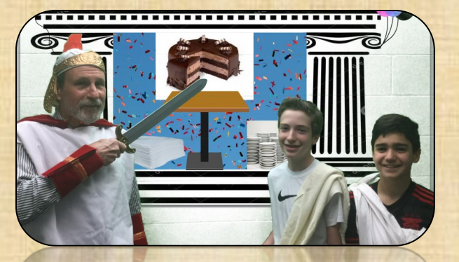
Alexander the Great visits a 6th grade agora, a marketplace in Ancient Greece.